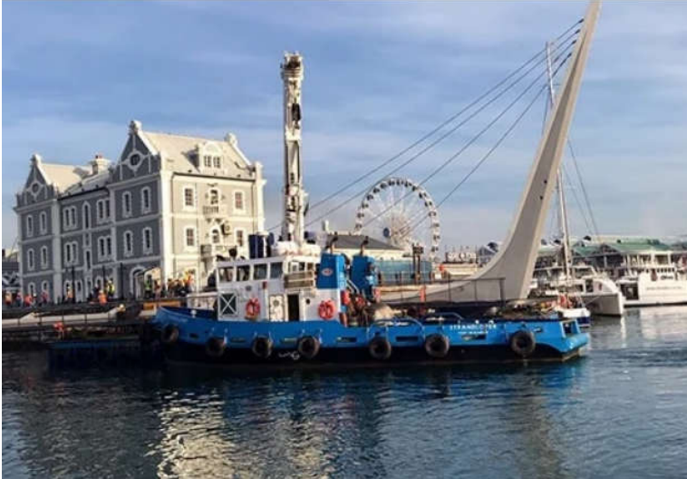
V&A's new swing bridge – Cape Town, South Africa